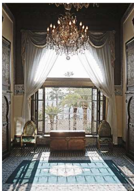
Sofitel Palais Jamaï Fez Morocco

Relations are at the heart of this vision and it is here that the art de recevoir will interweave intangible links between the senses and emotions of Sofitel guests. The Sofitel art de recevoir will be translated into six dimensions: an atmosphere of well-being and sensorialité ; personalized service; French mise en scène with the best of local cultures; French rituals for food & wine; designed technology to uplift experience; and places where life is magnifique . Each Sofitel hotel will feature a stylish façade, an iconic lobby, inspired French Style Décor, well-being bedrooms, inspired meeting rooms and a wellness area, with unique spas.